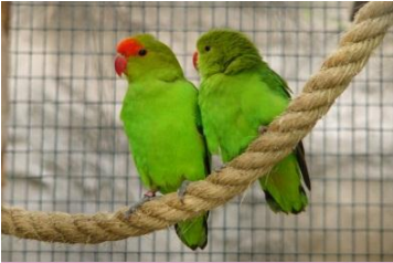
Agapornis taranta-Black winged lovebird