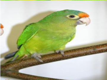
Aratinga canicularis-Petz conure