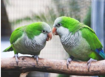
Myiopsitta monachus-Monk parakeet