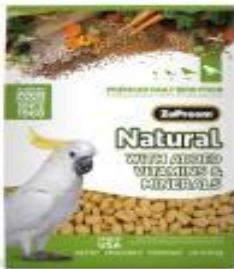
Parrots and conures natural