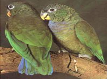
Pionus maximiliani-Maximilian pionus