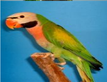
Psittacula alexandri dammermanni -Moustache