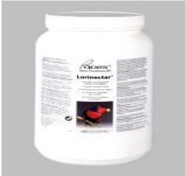
Aves product lori nectar