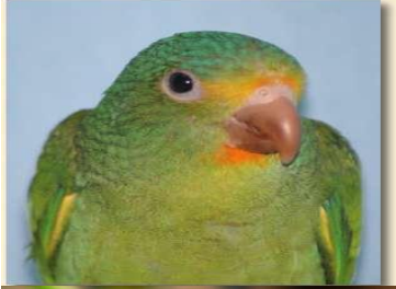
Brotogeris cyanoptera-Cobalt winged parrakeet