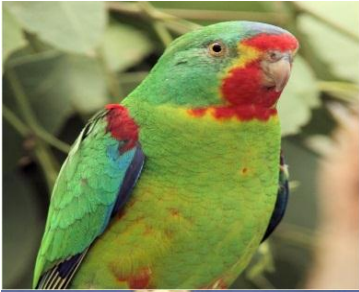
Lathamus discolor-Swift parrot