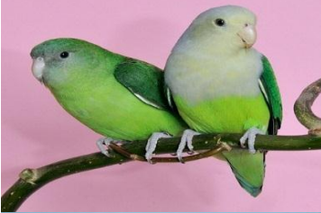
Agapornis canna-Madagascan lovebird