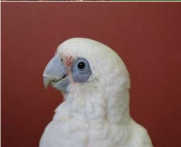
Cacatua sanguinea-Little corella