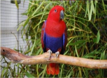
Eclectus roratus polychloros-New Guinea eclectus