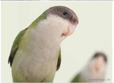
Psilopsiagon aymara-Sierra parakeet