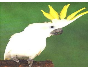
Cacatua galerita triton-Triton cockatoo