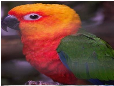
Aratinga jandaya-Jenday conure