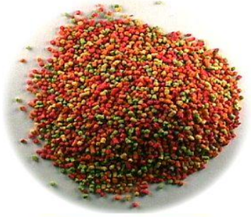
Cockatiels fruit blend