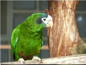
Amazona ventralis-Hispaniolan amazon