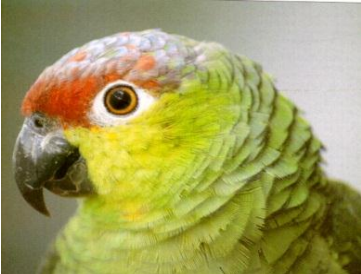
Amazona a.lilacina-Ecuador amazon