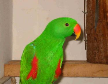
Eclectus roratus solomonensis-Solomon island eclectus