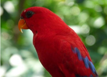
Eos bornea-Red lory