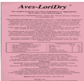
Aves product lori dry