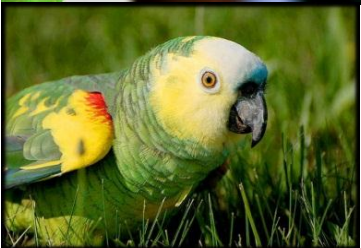
Amazona a.xanthopteryx-Yellow winged amazon