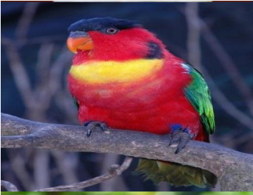
Lorius chlorocercus-Yellow bibbed lory