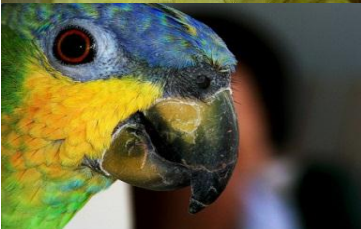
Amazona amazonica-Orange winged amazon