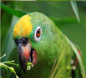
Amazona ochrocephala-Yellow crown amazon