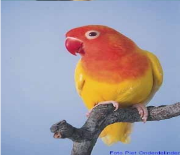
Agapornis fisheri lutino-Fisher lovebird