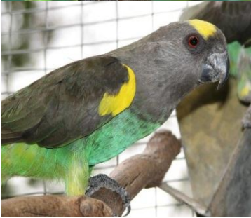
Poicephalus meyeri -Meyers parrot