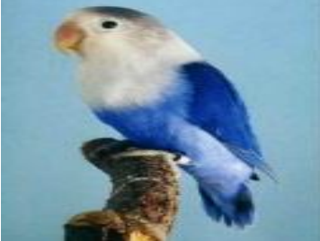
Agapornis fisheri cobalt-Fishers lovebird