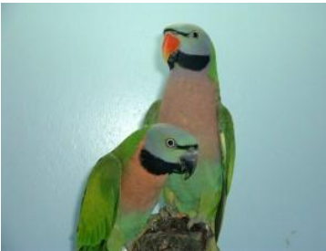
Psittacula alexandri fasciata -Moustache parakeet