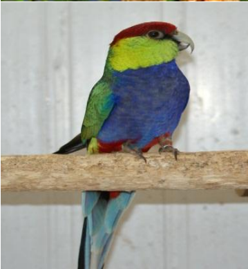
Purpureicephalus spurius-Red capped parrot