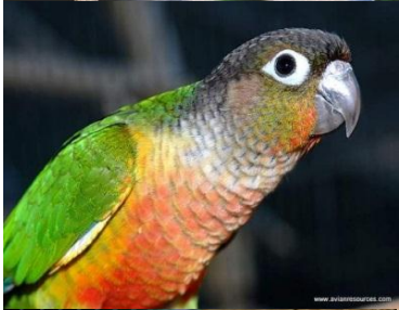
Pyrhura molinae hypoxantha-Yellow sided