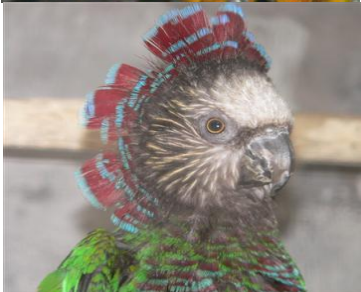
Derophtus accipitrinus-Hawkheaded parrot