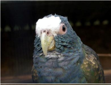
Pionus senilis-White cap pionus