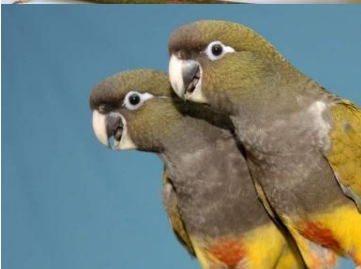
Cyanoliseus patagonus-Patagonian conure