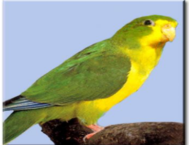
Psilopsiagon aurifrons-Mountain parakeet