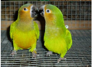
Aratinga pertrinax-Brown throated conure