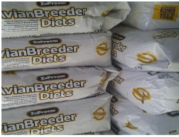
ZuPreem avian breeder diets 18kg