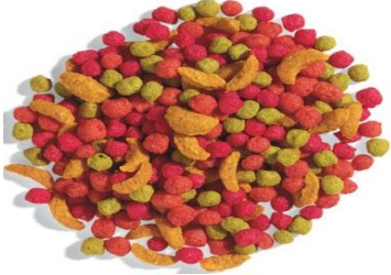
Parrots and conures fruit blend