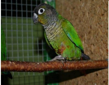
Pyrhura molinae-Green cheeked pyrrhura