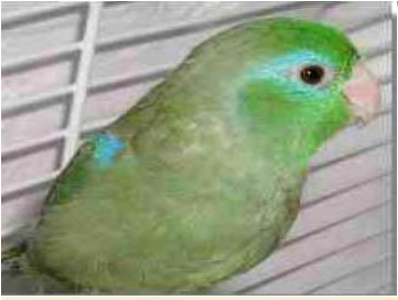
Forpus conspicillatus-Spectacled parrotlet