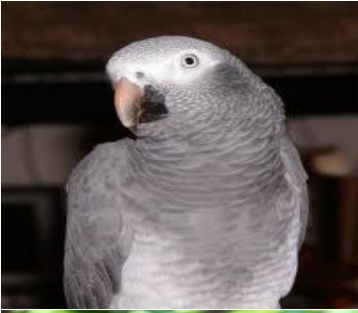
Psittacus e.timneh -Timneh grey parrot