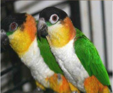
Pionittes melanocephala-Black headed caique