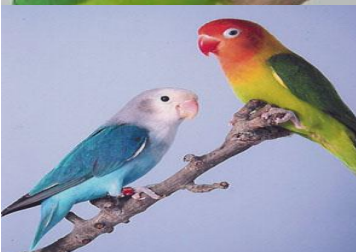
Agapornis nyassa blue-Nyassa lovebird