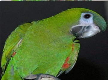
Diopsittaca nobilis-Hahns mini macaw