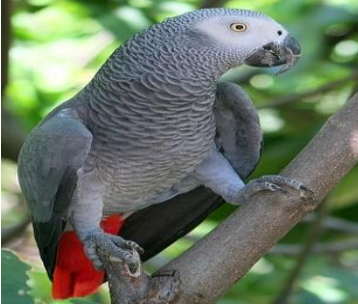
Psittacus e.erithacus -Congo grey