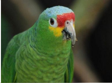
Amazona a. autumnalis