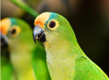
Aratinga aurea-Peachfronted conure