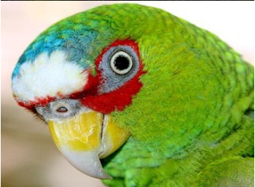
Amazona albifrons nana-White fronted amazon